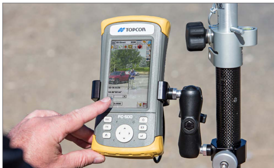
Photo documentation with live video

Connected to an external data collector LongLink™ provides the power at the remote rod position. The remote operator records the data for codes and rod heights for as-builts, eliminating most common errors. For stakeout, he/she can view directions required to find the stake point. The system becomes an economical robotic system where the instrument man simply needs to follow and aim at the remote prism. The DS with the XPointing feature finds the center of the prism automatically. LongLink communication is built into the RC-5 and has the ability to send a signal to the total station to quickly re-acquire the prism.